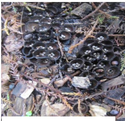
Cup fungi under Kahikatea trees