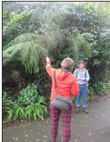
Discussing the weeping nature of the native broom, Carmichaelia australis

Some of the interesting discoveries were Miro and Matai growing almost next to each other so one could closely observe differences in leaf shape and habit, Kahikatea berries in close range ( we even got to sample one), Chatham Island Astelia, Native broom, huge Ngaio, Rewarewa and Titoki with fruit, and a stand of mature lancewoods.